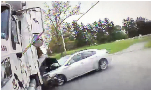
Actual photo from a Road-iQ customer's side blind spot camera during a crash.